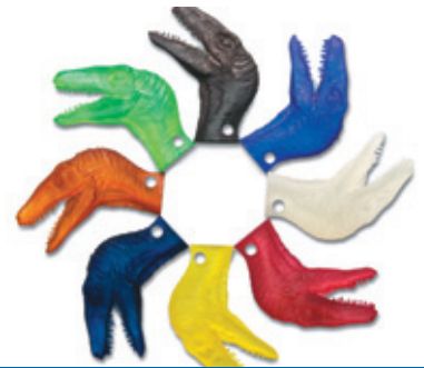
Figure 3: Aniline dye comes in a wide range of colors and is sold as a stain for leather or wood