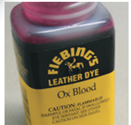
Figure 1: Red leather dye bottle