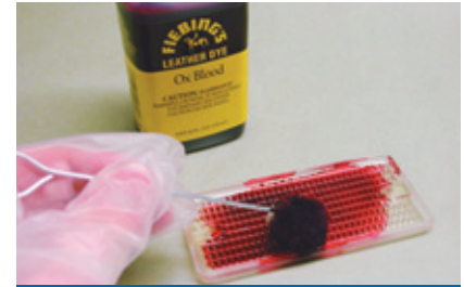
Figure 2: Apply aniline dye Aniline dye is applied to the model by brushing (shown), or dipping

Woodworkers Supply Inc. – www.woodworker.com